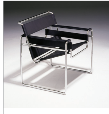
600 Breuer Wassily Chair