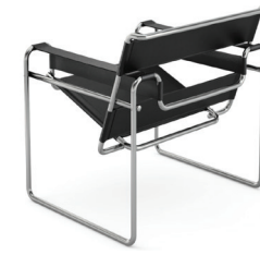
600 Wassily Lounge Chair $3213 List in OFC standard black leather $3505 List in OFC colored leathers