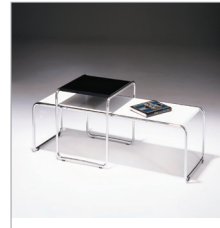
91910/91920 Laccio Tables