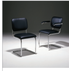
151/251 Breuer Cantilever Seating