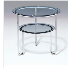
91635/91636 End tables