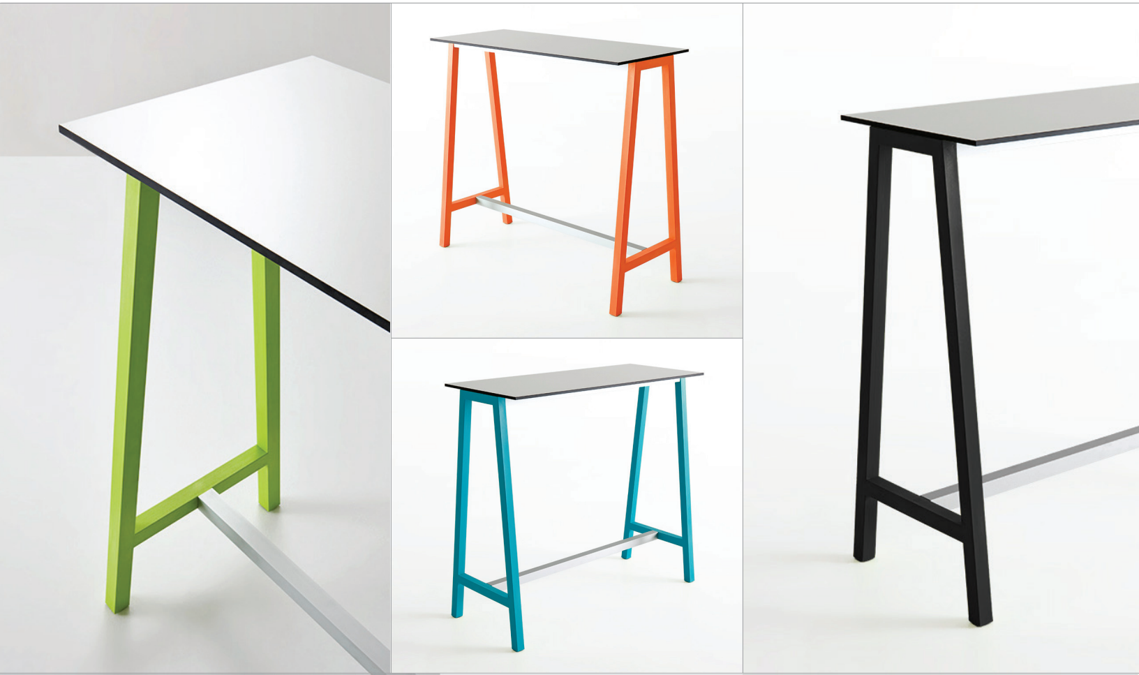
Co-Injected steel Frame. Durable TechnoPolymer compactop work surface.

Step out. Step in. Unquestionably a step up.