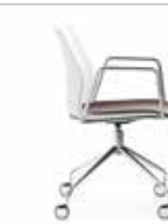
1152A Vortex Swivel Arm w Casters