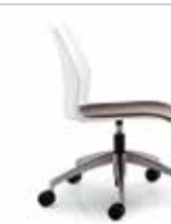
1153 Vortex Task Chair w Casters