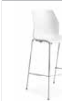
1143 Vortex 4 Leg Barstool