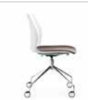
1151 Vortex Swivel with Casters