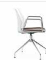
1152 Vortex Swivel Arm Chair