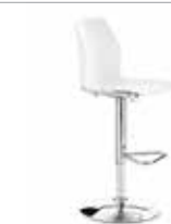
1146 Vortex Pedestal Barstool