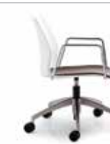
1153A Vortex Task Arm w Casters