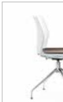
1150 Vortex Swivel Chair Armless