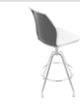
1145 Vortex Rocket Base Barstool