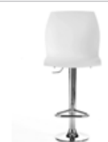
1147 Vortex Fixed Pedestal Barstool