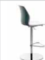
1146FC Vortex Pedestal Barstool