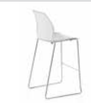
1144 Vortex Sled Base Barstool