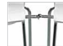
Ganging Device $60 List per chair

Black steel frame with casters. Stacks up to 20 chairs high without upholstery. 12 chairs recommended if upholstered.