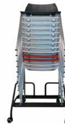
Dolly Cart $411 List

Black steel frame with casters. Stacks up to 20 chairs high without upholstery. 12 chairs recommended if upholstered.