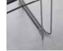
Ganging Device $122 List per chair