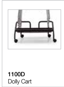
1100D Dolly Cart