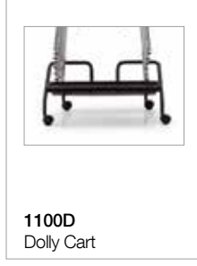
1100D Dolly Cart