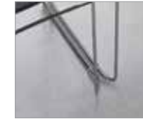
Ganging Device $122 List per chair