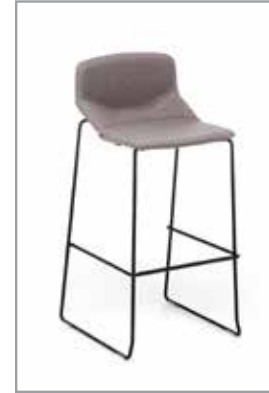
Black Painted Frame: $920 List