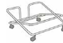
Dolly Cart $476 List