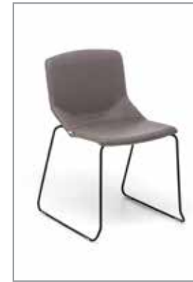
Chrome or Painted Frame: $740 List