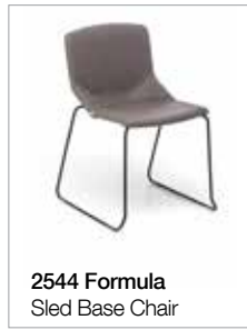
2544 Formula Sled Base Chair