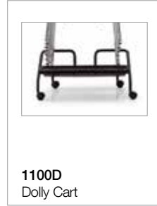
1100D Dolly Cart