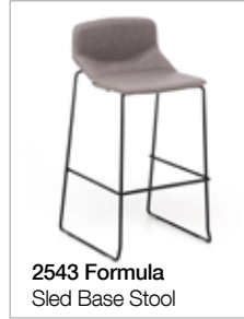
2543 Formula Sled Base Stool