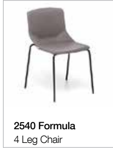
2540 Formula 4 Leg Chair