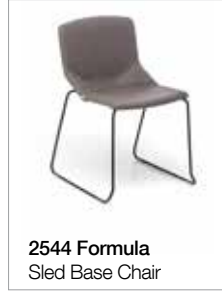
2544 Formula Sled Base Chair