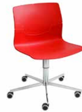
Chrome Frame $769 List