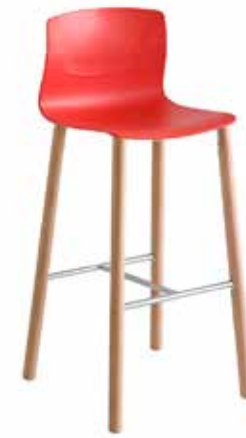
Wood Frame $951 List