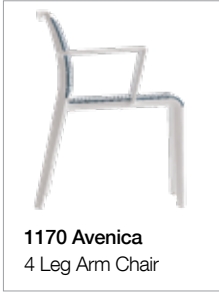
1170 Avenica 4 Leg Arm Chair