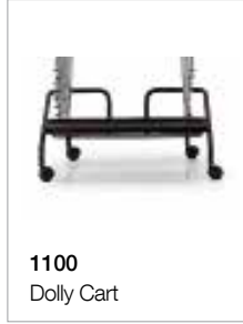
1100 Dolly Cart