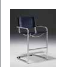
Roma Series 661 Stool