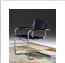
Roma Series 661 Chair