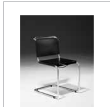
410 Series Chair