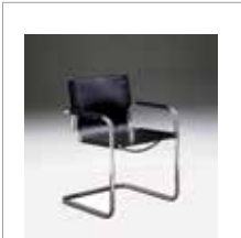
Roma series 661B Chair