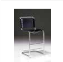
410 Series Stool