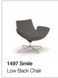
1497 Smile Low Back Chair