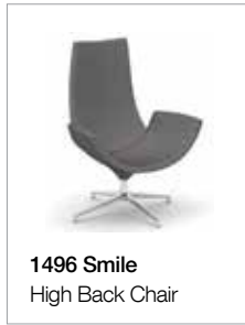
1496 Smile High Back Chair