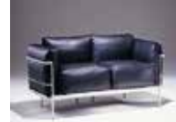
LC/5 Corbusier Grand Soft Sofa