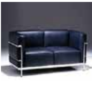
LC/10 Corbusier Grand Firm Sofa