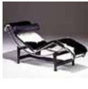
1380 Corbusier Chaise Lounge