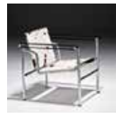
850 Corbusier Basculant