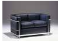
LC/4 Corbusier Petit Confort Chair