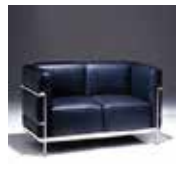
LC/9 Corbusier Grand Firm Sofa