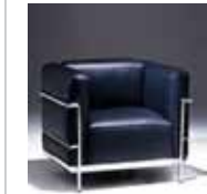
LC/8 Corbusier Grand Firm Chair