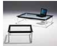
Corbusier Table bases