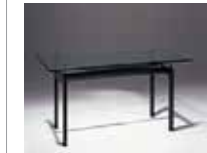
90155 Corbusier Trestle Table