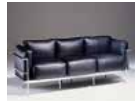
LC/7 Corbusier Grand Soft Sofa