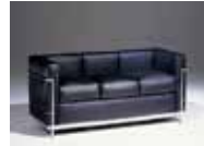
LC/6 Corbusier Petit Confort Chair