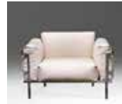
LC/3 Corbusier Grand Soft Chair