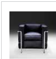
LC/2 Corbusier Petit Confort Chair