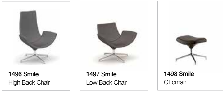
1496 Smile High Back Chair