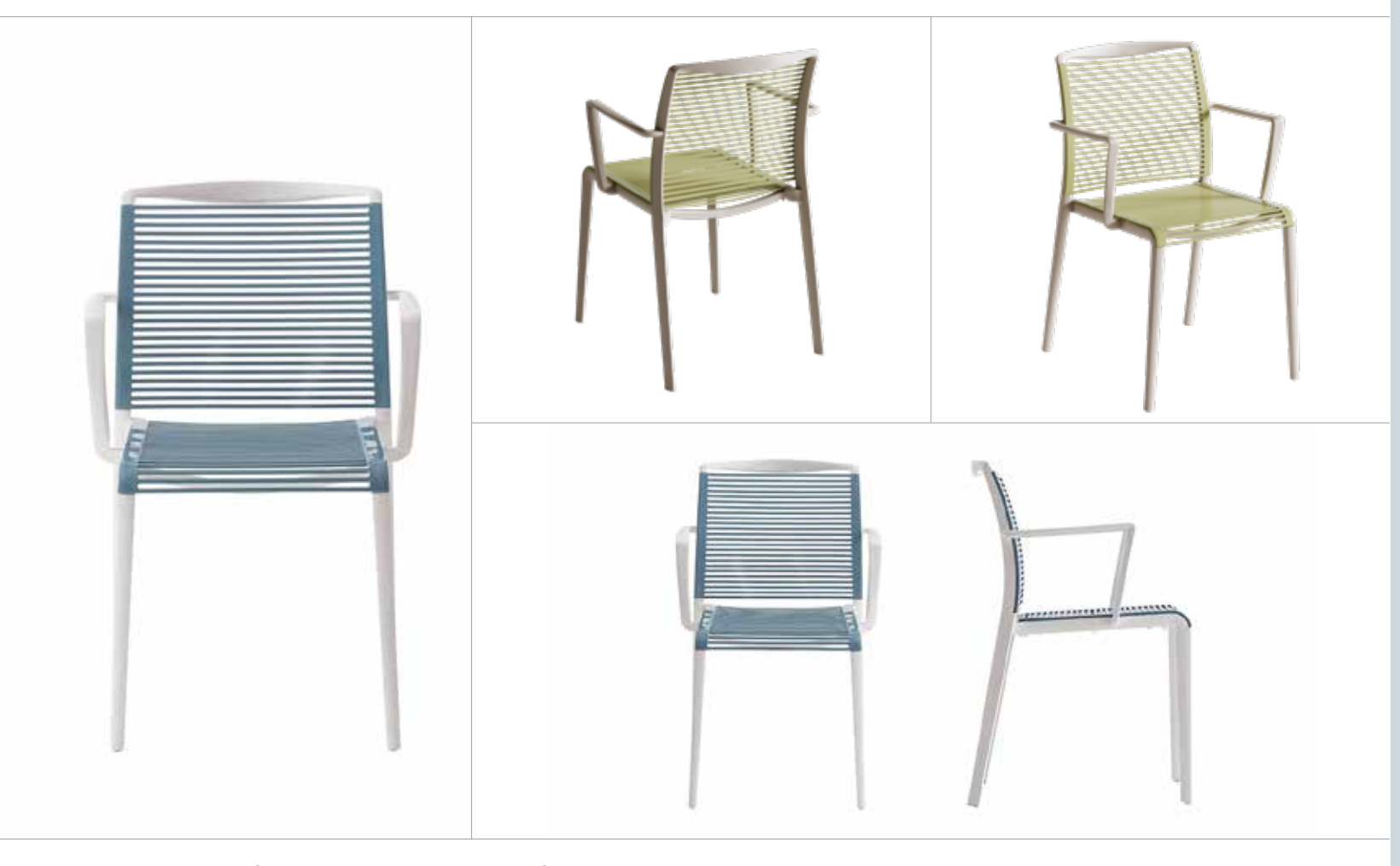
Light, durable, fun, yet serious. suitable for outdoor use.

It's fun. It's serious. It's a comfy contradiction.